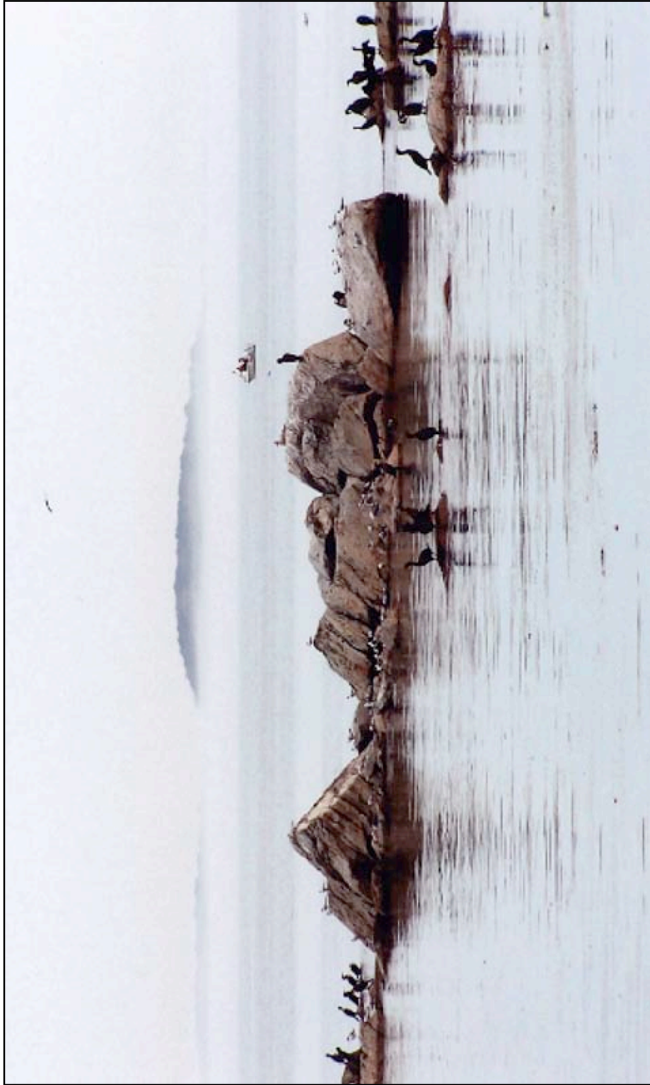
Peterson's Rocks at bottom of Bay Street.