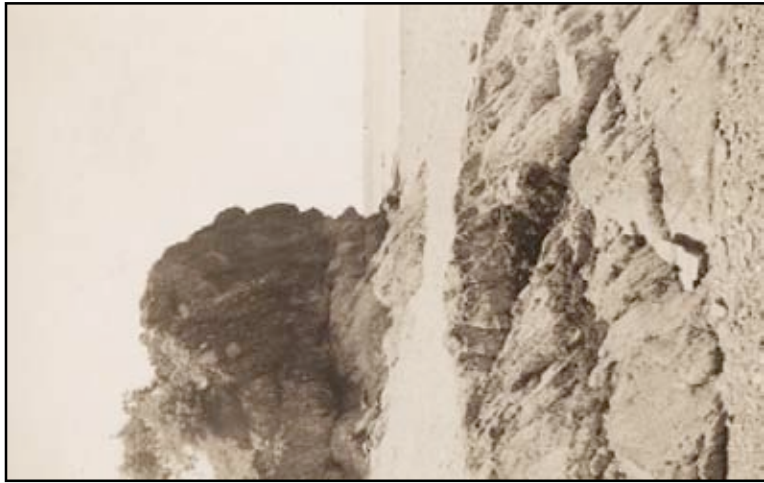
Squaw Rock (c.1929)